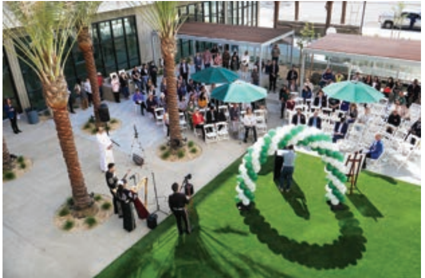
Community leaders, residents and others attended the Grand Opening of the Blossom Valley Senior Apartments on March 21.

One-third of the apartments will be set aside for Permanent Supportive Housing residents who will be referred by the County of Santa Clara with additional supportive services from Abode Services. Resident