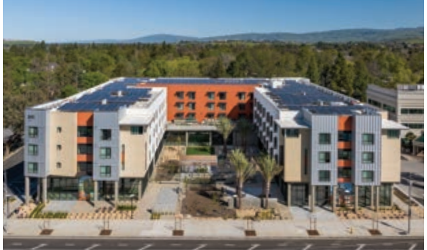
Blossom Valley Senior Apartments occupy the upper levels of the new development at 399 Blossom Hill Road where the ground floor will soon be operating as the Blossom Valley Family Center.

Martha's Kitchen intends to build an 11,000-square-foot commercial kitchen on the ground floor to prepare meals that will be delivered to those in need throughout the community. They will also operate a food pantry on the premises.