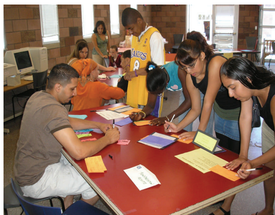
ILP teens pay their bills during the "A Day in the Life of Independent Living" activity.